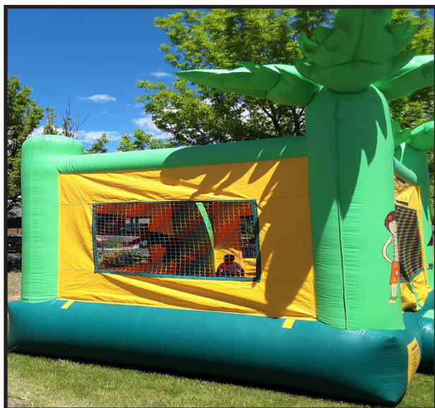
Kiddos were tickled pink with the bounce house.