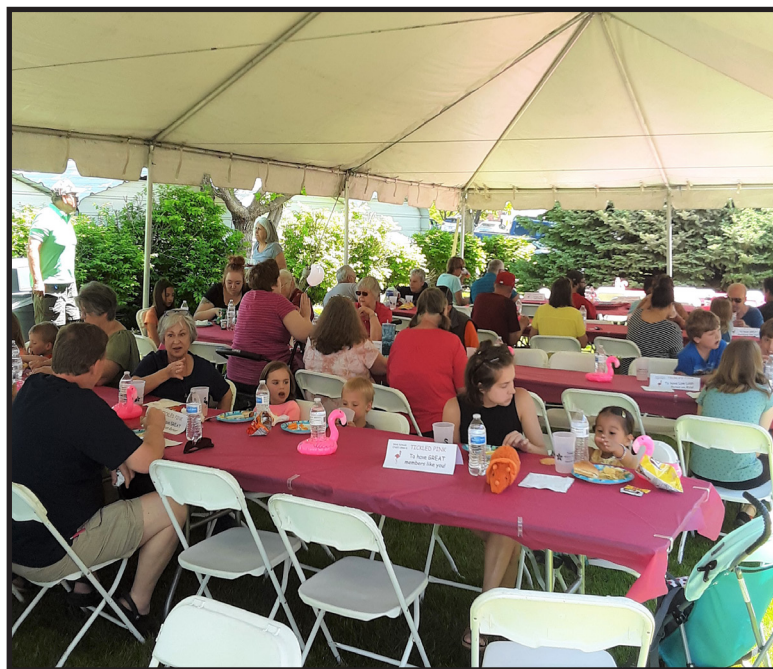
WSCU members enjoying the tickled pink vibe!