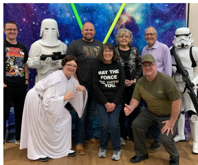
The WCCU Board along with Storm Troopers and Princess Leia