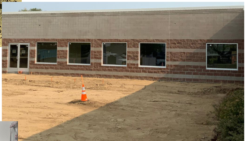
Now it's starting to look like the rest of the building.