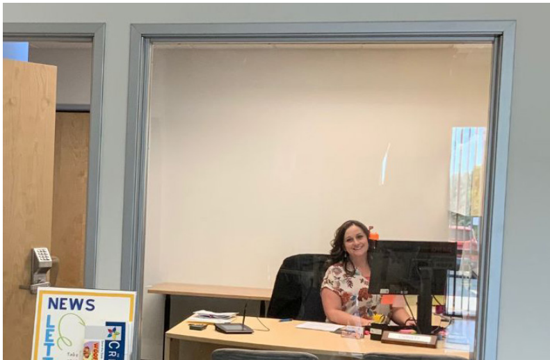
And new Member Service's Manager Office.