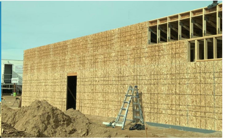
Enclosing the new building.