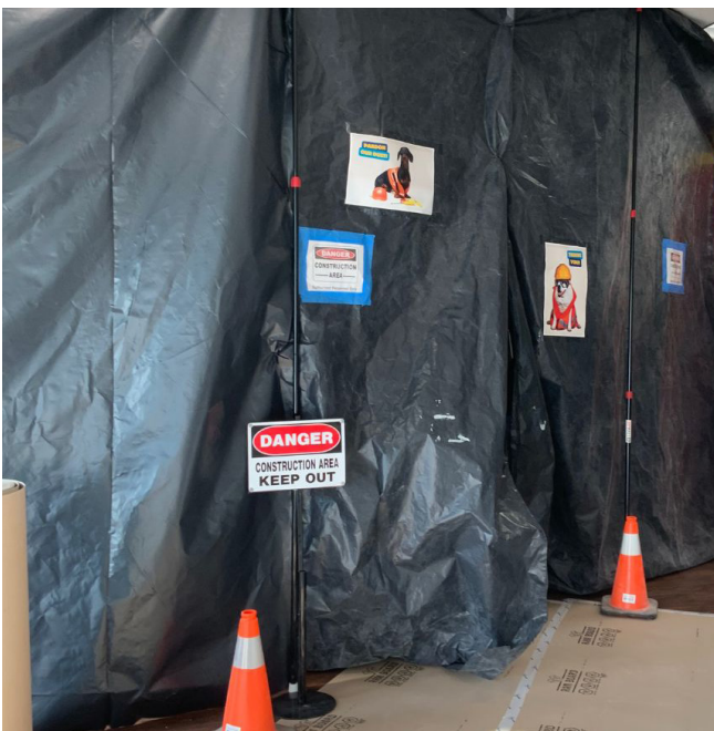
The black curtain moves...