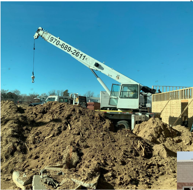
Setting the trusses.