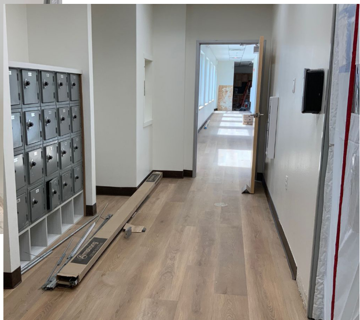
Ahhh, that looks so much better!