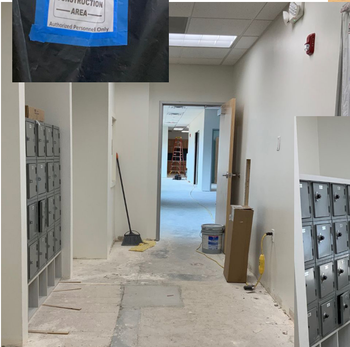
Oh what a mess! Somebody, use that broom!