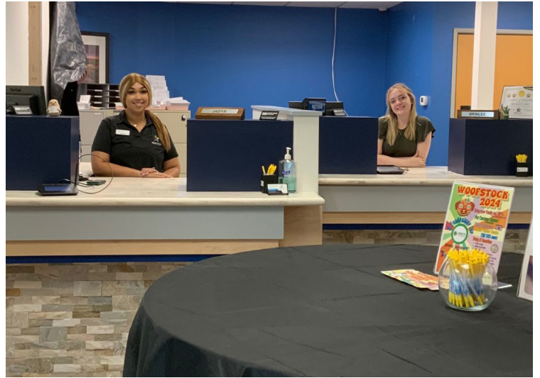
...reveals new teller stations!