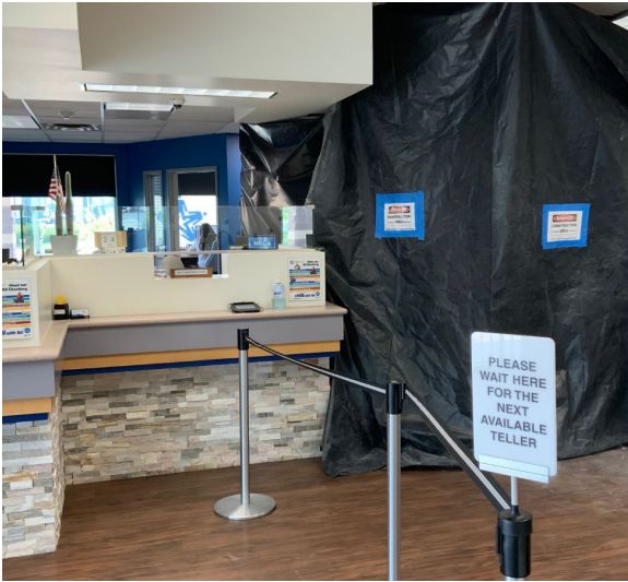
Behind the black curtain...